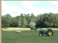
Justin starts filling the hay huts.

The mornings have started to cool down and the grass has stopped growing. Even though the fields are still green we start putting out the hay so the retirees can get used to it before we get our first frost.