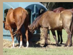
Sunshine, Beau and Herman enjoying their afternoon snack.