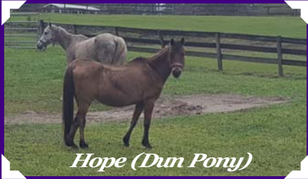
Hope (Dun Pony)