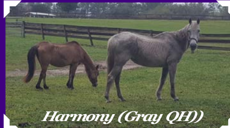
Harmony (Gray QH)

Our newest retirees arrived March 2nd from Sumter County Animal Control after being in their facility for 3 months. And since both are over 20 years old they faced an uncertain future. Usually these older horses are euthanized or are auctioned off...to a sad fate.