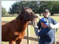
Little Bit gets a Checkup

A former polo horse and one of our newest arrivals gets major surgery after it was discovered he was most likely hit in the face with a polo mallet causing two of his teeth to protrude through the gums. Zippy has made a full recovery and is living pain-free for the first time in almost a decade.